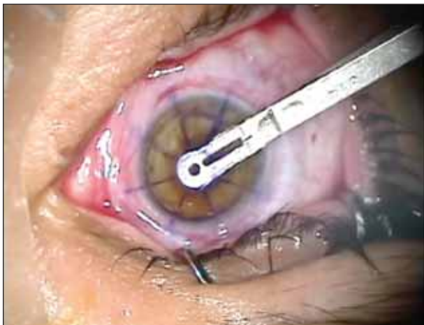
Figure 1. Implantation of the inlay into the corneal tunnel.

The Flexivue Micro-Lens corneal inlay (Presbia Coöperatief UA, Amsterdam, Netherlands) is a refractive hydrophilic polymer lens intended for insertion inside a corneal stromal tunnel in the nondominant eye. The lens' central zone is free of refractive power, and the peripheral zone has a standard positive refractive power. The diameter of the Flexivue is 3 mm, and the thickness is less than 20 \mu\text{m} .